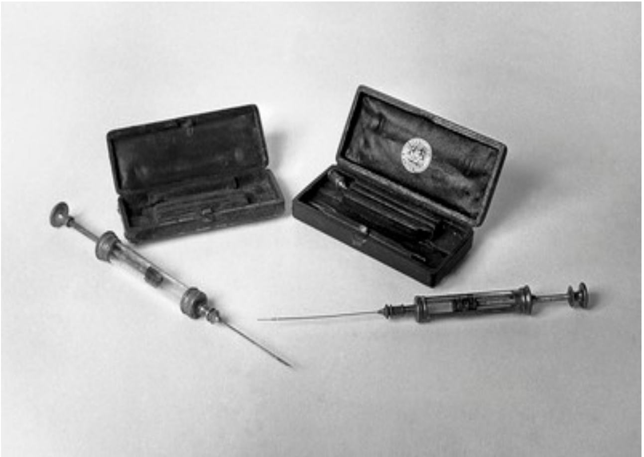
Syringes: Hypodermic, made by Down Bros.